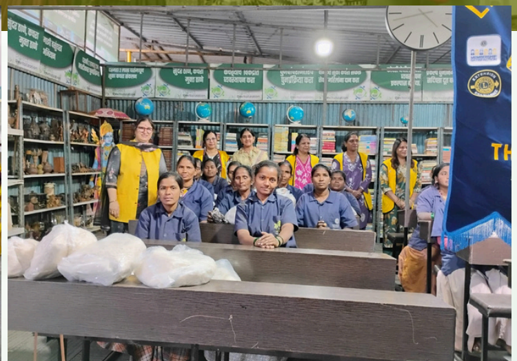
Lion club of Thane distributed grocery on the occasion of Haldi Kumkum