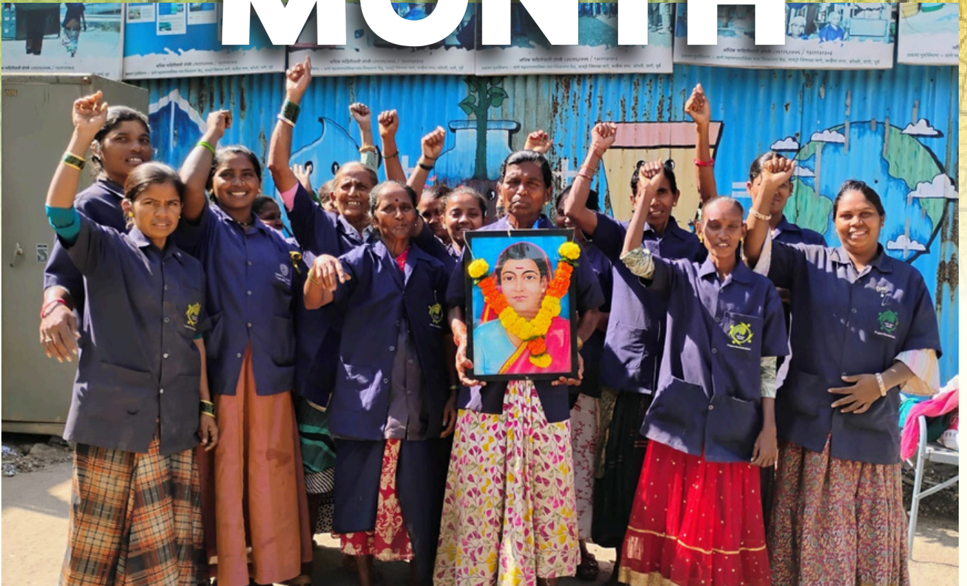
On the occasion of the birth anniversary of Savitribai Phule, the first female teacher in India, headmistress, pioneer of women's education, mother of knowledge, and the one who showed