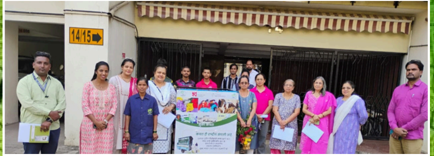
Samarth Bharat Vyaspeeth Project Revitalisation Campaign, attractive bins for dry waste collection are being provided free of charge to participating societies.