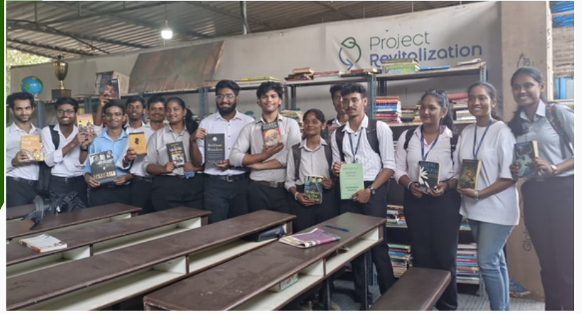
Vidyalankar school of IT