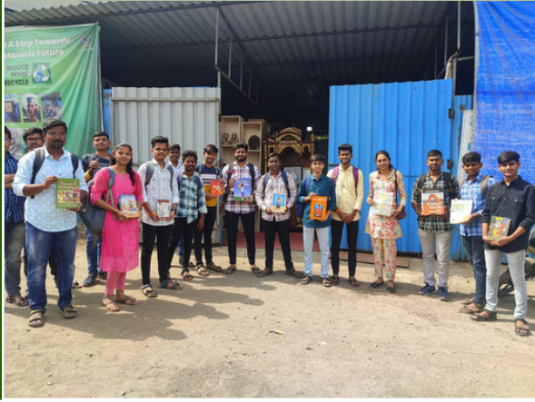
S S Jondhale Polytechnic