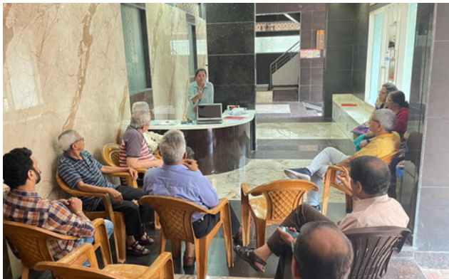
Awareness session on Project Revaitalization done at Dhanashree society