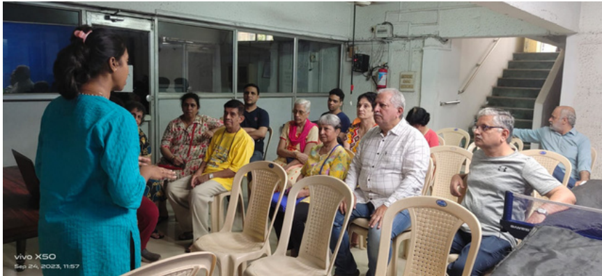
Patel Apartment Charai Awareness Session