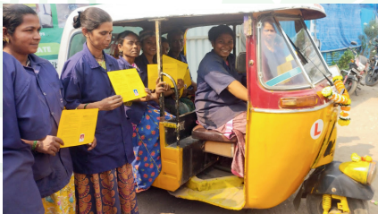
1st day of Training