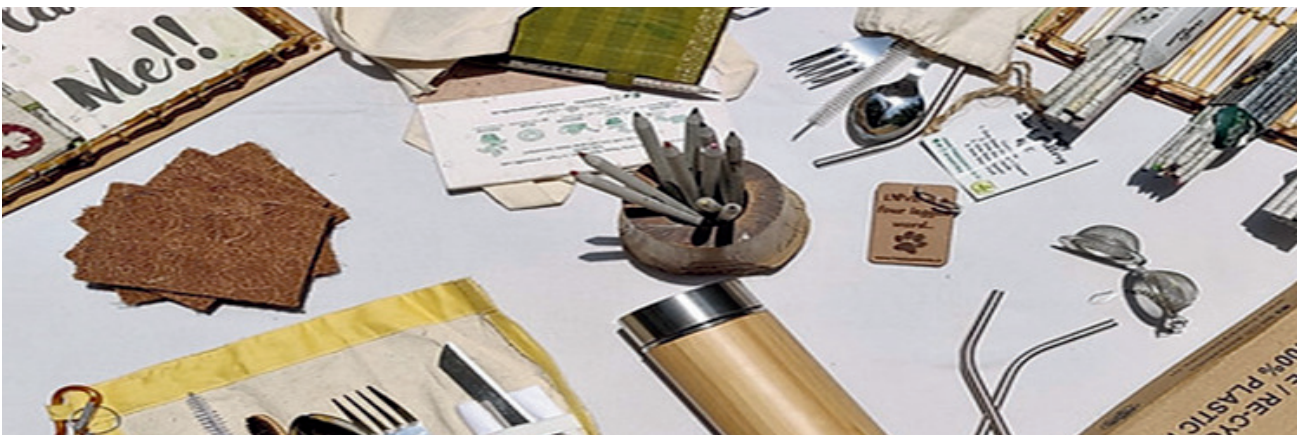
RE-CONNECTING HUMANS TO NATURE