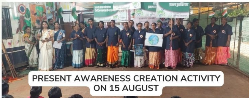
PRESENT AWARENESS CREATION ACTIVITY ON 15 AUGUST