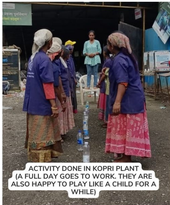
ACTIVITY DONE IN KOPRI PLANT (A FULL DAY GOES TO WORK. THEY ARE ALSO HAPPY TO PLAY LIKE A CHILD FOR A WHILE)