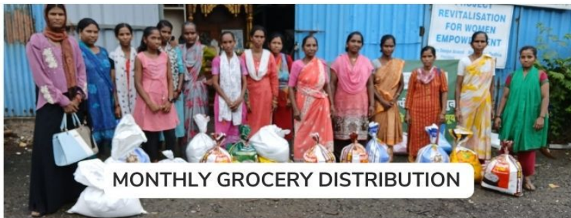
MONTHLY GROCERY DISTRIBUTION