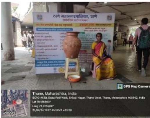
Installation of water Dispenser