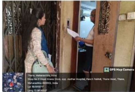
Door to door waste segregation awareness campaign I