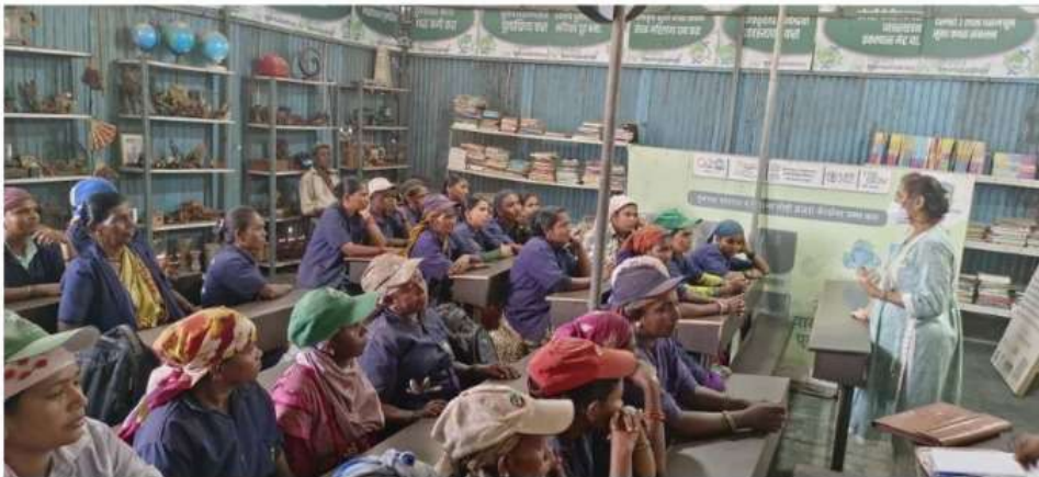
Monthly Health checkup