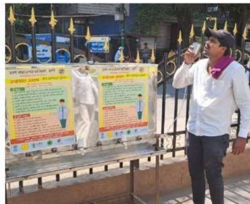
Samarth bharat vyaspeeth installed water dispenser at thane railway station, tin hath naka junction and ram maruti road